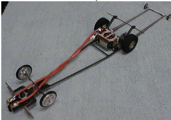
DRS-238 Long Wheelbase Pro-Stock Truck