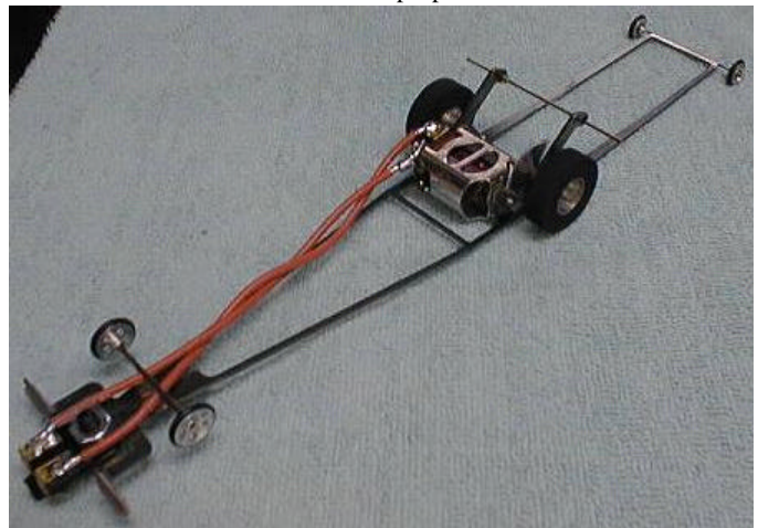
DRS-239 Pro-Alcohol Funny-Car