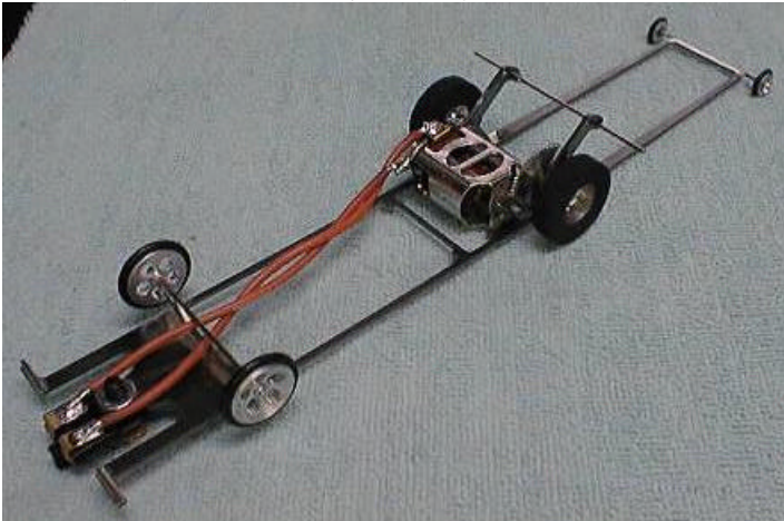
DRS-236 Pro-Factory Modified.